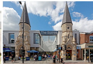
The Spires opened in 1989