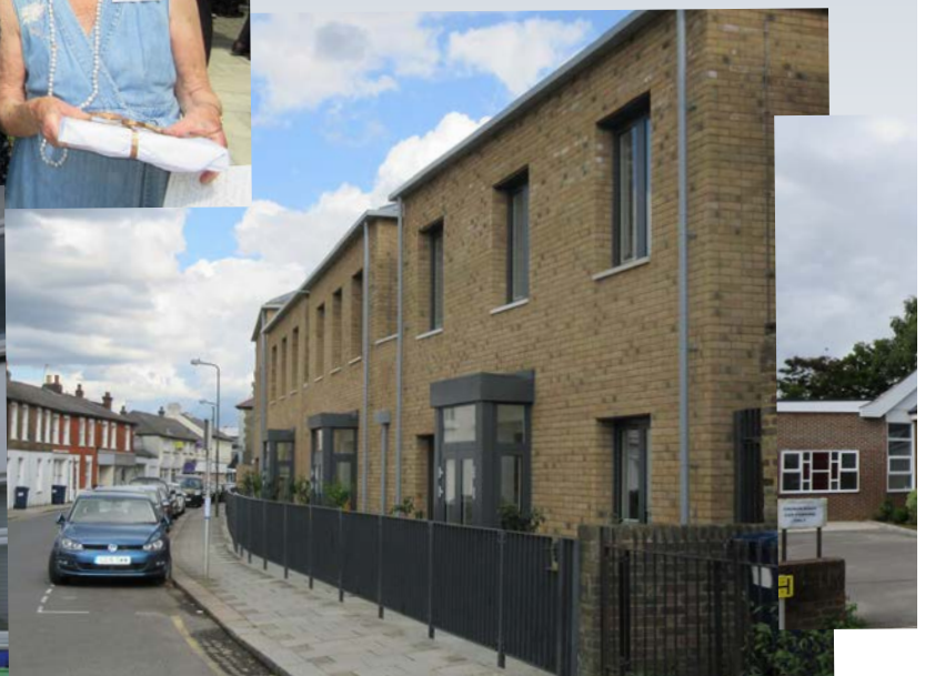
New Ground co-housing flats for older women were "sensitively" designed to meet the needs of its residents and to blend into Union Street, making it the overall winner in the 2017 Housing Design Awards