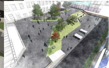
(Above) The latest plan, which envisages a smaller school of 1,200. (Right) The internal courtyard in the original one