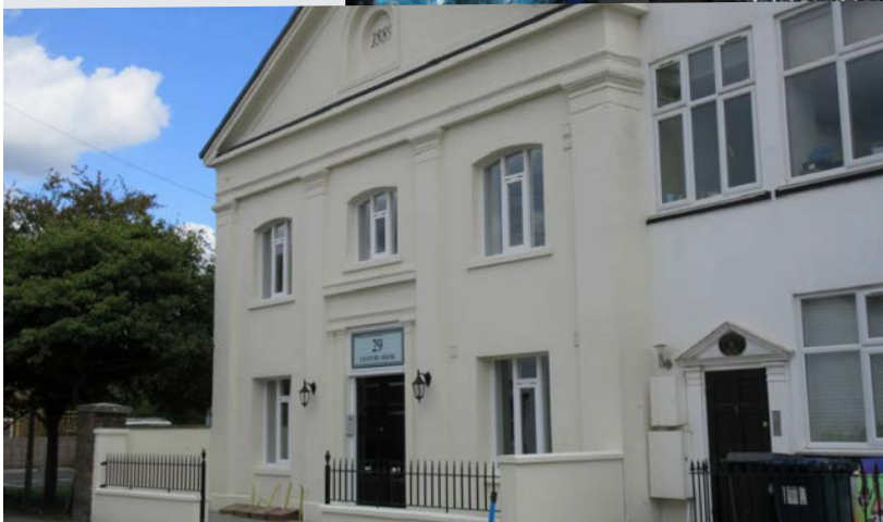
Barnet's former Town Hall – in use between 1889 and 1912 – has now been converted into flats