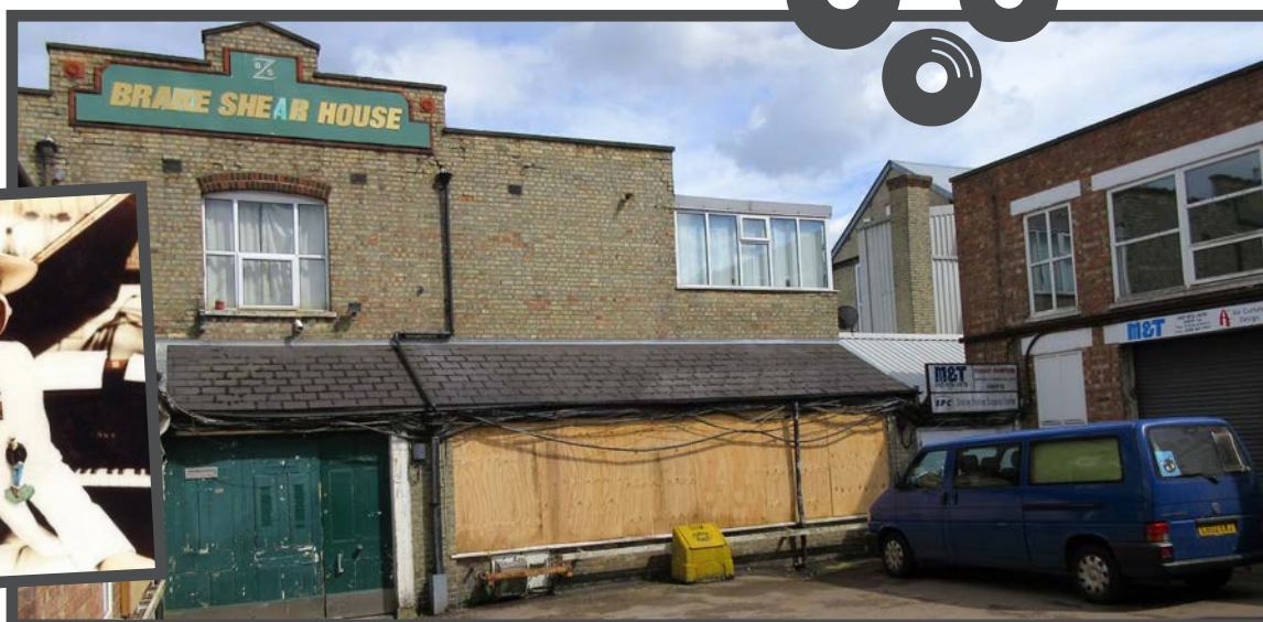
All in a spin: Elton John was one of many musicians who recorded at the threatened Brake Shear House,