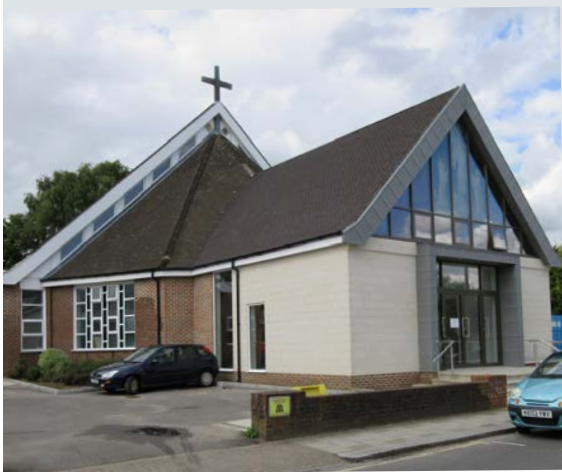
Finishing touches were added during the summer to a 100-seat extension to St Greg's, increasing seating capacity to 340

Further details: https://barnet.gov.uk/citizen-home/planning-conservation-and-building-control/design-awards.html