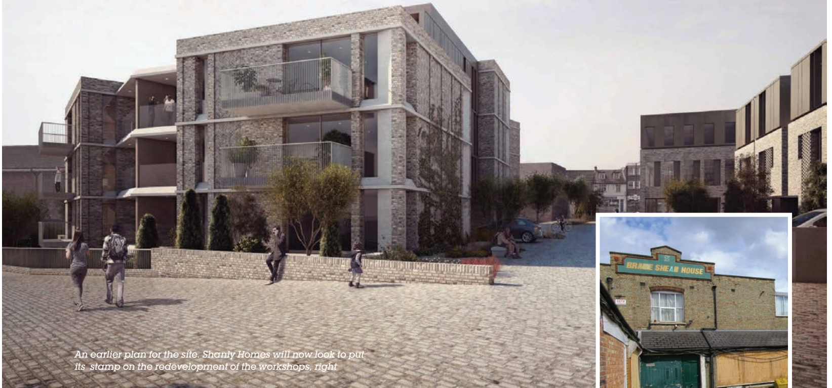
An earlier plan for the site. Shanly Homes will now look to put its stamp on the redevelopment of the workshops, right