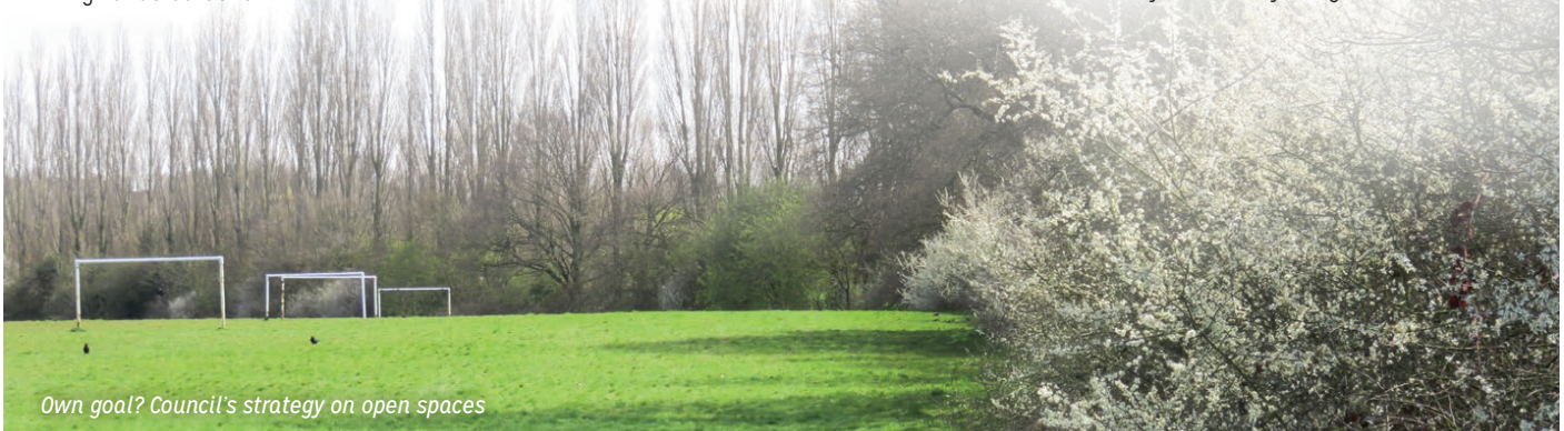
Own goal? Council's strategy on open spaces

It can't be right – to take one example – to classify Hadley Wood as low in both quality and value. It's a remarkable enclave of ancient and mainly indigenous woodland (the former Enfield Chase) miraculously preserved within London, and unique in Barnet.