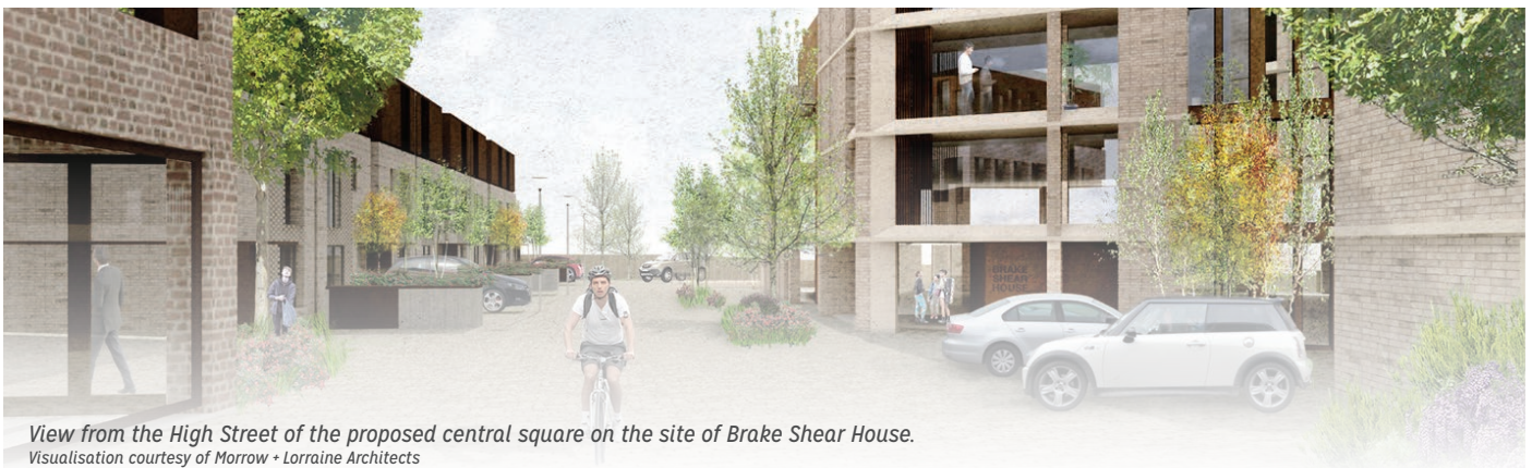
View from the High Street of the proposed central square on the site of Brake Shear House.