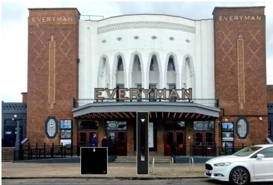
Everyman Cinema, Barnet with JOLT EV charger and feeder in central pride of place

On the exact axis of the cinema’s symmetrical façade and within 5 metres of its main entrance, Jolt wants to plant a charger 2.7 metres high and 1.2 metres wide. It’s as if the mysterious tablet in 2001, A Space Odyssey had landed – with added illumination and animated displays. The irony is painful and shows utter disrespect to the listed building, as well as annoying cinema-goers and the general public. It must be sent to join the Decaux telecom zombies in outer space.