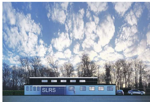
Quinta Club: (L) existing, (R) proposed