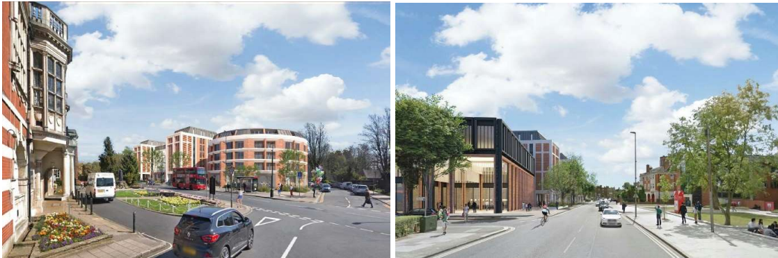
The Burroughs – proposed views: (L) to N-W, Town Hall on L & new library on R, (R) to S-E