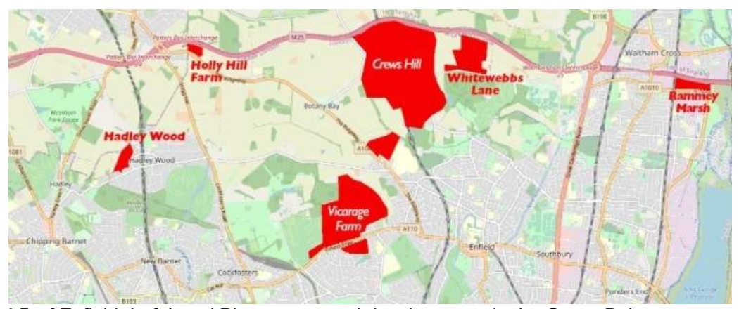
LB of Enfield draft Local Plan – proposed developments in the Green Belt