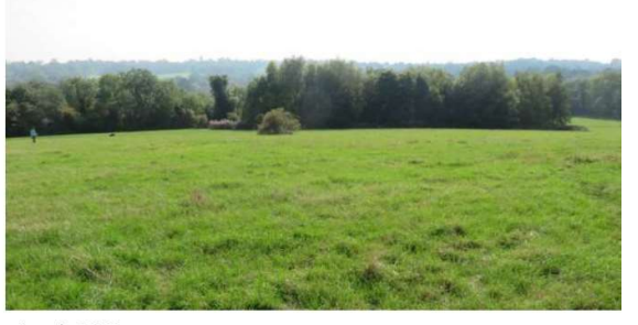
Look S-W: Enjoy miles of uninterrupted trees and meadows