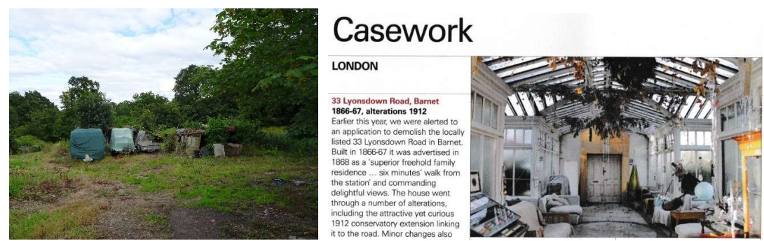
Left - Hadley Highstone site in Green Belt; Right - 33 Lyonsdown Road I The Victorian

9. Land to rear of 14 Hadley Highstone (GB) – In 2019 we objected to a new house on Green Belt land, and permission was refused. The owner appealed, but the appeal was dismissed. The Council then served an Enforcement Notice requiring removal of various structures littering the site, and the owner has appealed against it.