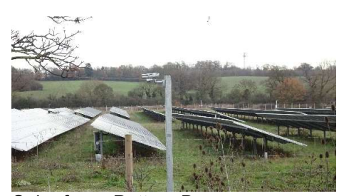
Solar farm, Potters Bar

Barnet has denied plans to build solar farms & batteries on these.