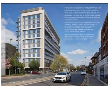
2017 application (refused)

New proposal for extra 2 storeys on existing slab & 263 x 1-3 bed flats (263). This is bigger & no better-designed than the 2017 application, which was refused.