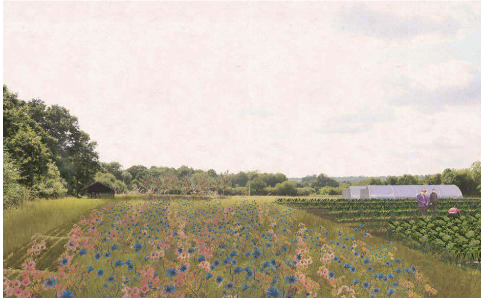
Visualisation of Academy farm by Assemble Design

We still await a date for the Whalebones estate application for 152 homes go to Planning Committee, also for TfL/Taylor Wimpey's application for High Barnet Station. Other significant cases are summarised.