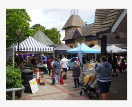
Barnet Market – A symbol of our town identity for over eight centuries, it's proved surprisingly resilient against development threats and Covid-19.

The existing market must be kept (but not necessarily on the same location) and given room for growth, perhaps in a town square.