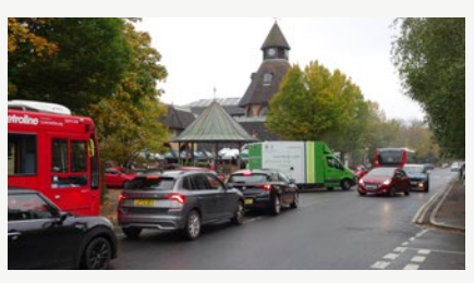
Spires service entrance, Stapylton Road – At peak times, a hazardous confusion of cars, buses, lorries and pedestrians.

Safe provision must be made for disabled drop-off and pick-up, and improvements made to the Stapylton Road bus interchange and pocket park.