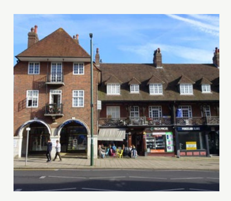
Hampstead Garden Suburb gateway, Finchley Road – A classic Arts & Crafts shopping parade with flats above.

A mixed retail/business/residential development would have more vitality than a single use.